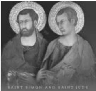
Ss. Simon and Jude